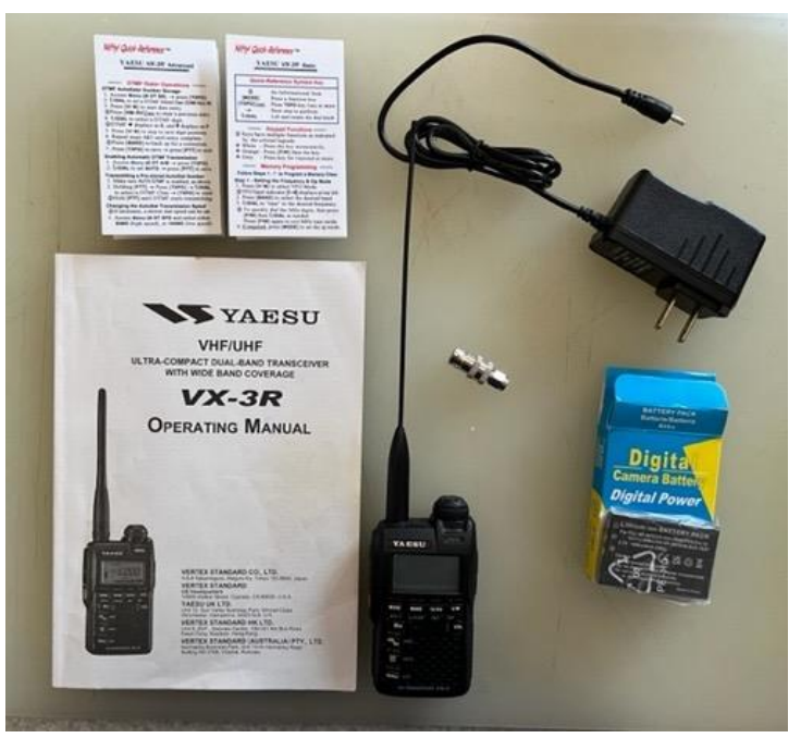
All the items in the above photo are included.